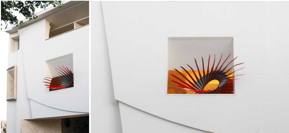
Layer, A Loose Horizon, 2012. Powder coated aluminium.