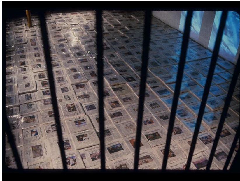
Above the Fold (still), 2002, Mixed media and video installation.

All editions are unread and shielded in UV protective plastic, which reflects light in such a way as to suggest a watery surface. Metal bleachers will allow the visitor to survey the landscape from a higher position, alluding to the experience visitors have at Ground Zero as they gaze into the giant concave space. A double video projection above the newspapers plays in three segments: a black and white video of an open-heart surgery in progress transitions into two vertical tower-like rectangular shapes surrounded by water for the second segment. In the final part of the video, the two towers dissolve into the surrounding water while rose petals float on its surface. The accompanying audio track of a low frequency heartbeat suffuses the room with a discordant feeling of both reassurance and dread.