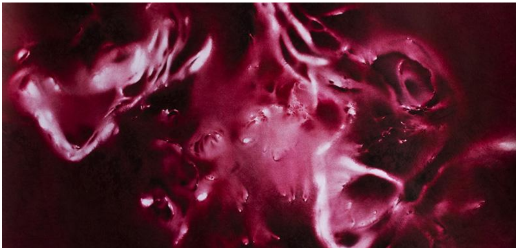
Video Still, Fascinomas (Red) , 2011. Acrylic on paper.