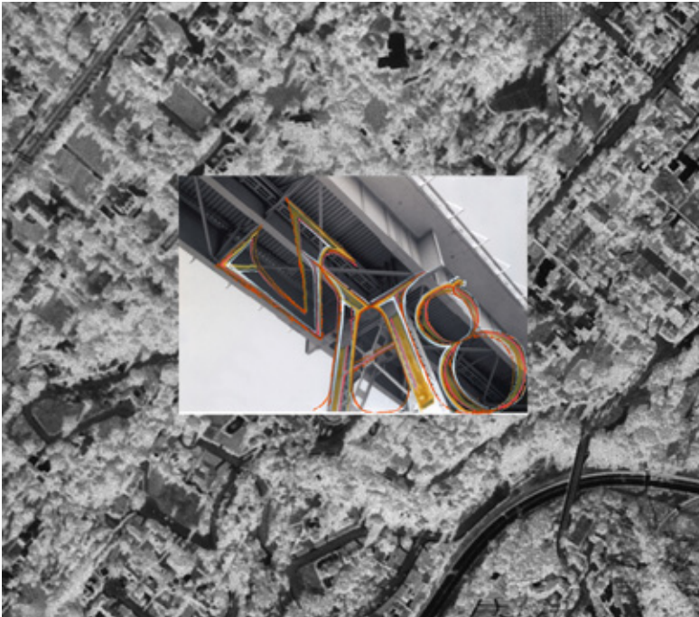
John O'Brien, Meander [detail from scale model maquette of Meander ], 2012. Ink, acrylic paint, and digital photo on matte paper and drawing.

This exhibition is supported by the Board of Directors of the Pasadena Museum of California Art.