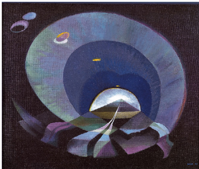
The Tunnel, 1949. Oil on canvas, 24 ½ x 29 ½ inches.