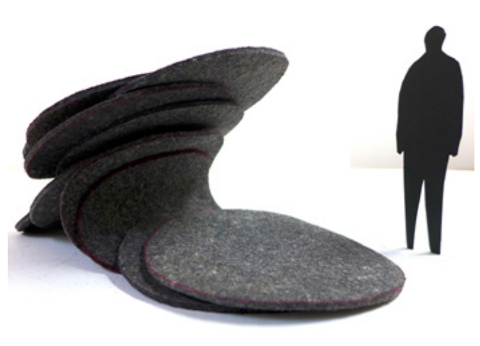
Left to Right: Joan Perlman, Untitled , 2016. Monoprint on Yupo, 20 x 30 inches. Courtesy of the Artist; Lloyd Hamrol, Study for Overflow , 2015. Industrial felt. Courtesy of the Artist