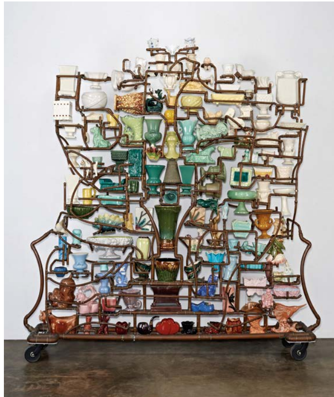
Joel Otterson, American Portable Pottery Museum , 1994. Ceramic, copper, plumbing pipe, steel, and casters, 93 × 104 × 20 inches.

Pasadena, CA — The Pasadena Museum of California Art (PMCA) is proud to present the contemporary exhibition Interstitial . With new and recent free-standing sculptures by seven Los Angeles-based artists, curator John David O'Brien addresses the question: What happens to ordinary entities of domestic life when they are moved from their quotidian contexts, transformed through the art-making process, and reconfigured in the formal space of the museum? The community of object makers answers this question with works that exist in the interstitial space, in between the memories of objects' conventional functions and their abrupt and unexpected presences as artworks in the museum.