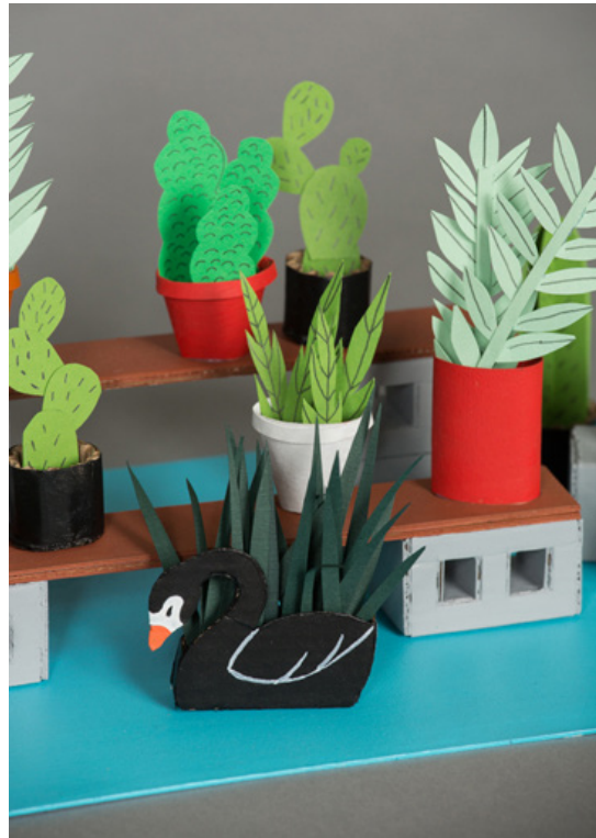
Ana Serrano, Jardinsito [detail], 2013. Cardboard, paper, acrylic paint, 12 x 7 x 7 inches, Photo © 2013 Julie Klima

Mexican-American artist Ana Serrano’s urban “garden” installation reveals human interaction with urban and rural landscapes