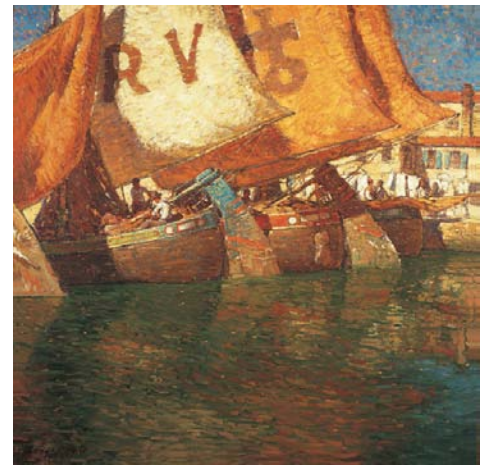
Cargo Boats, Chioggia, Italy, 1923 Oil on canvas, 43 x 43 in. The Buck Collection, Laguna Beach,