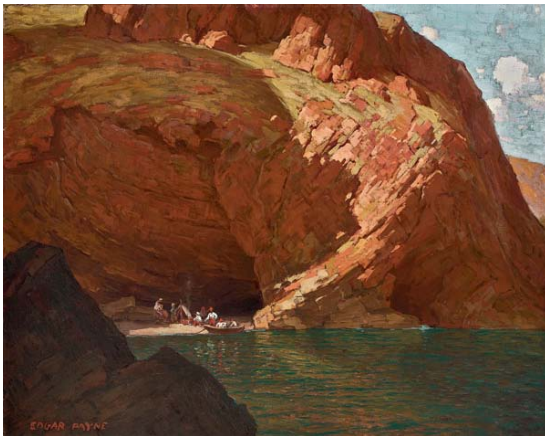
The Rendezvous (Santa Cruz Island, CA), 1915 Oil on canvas, 33 x 42 in. Private collection