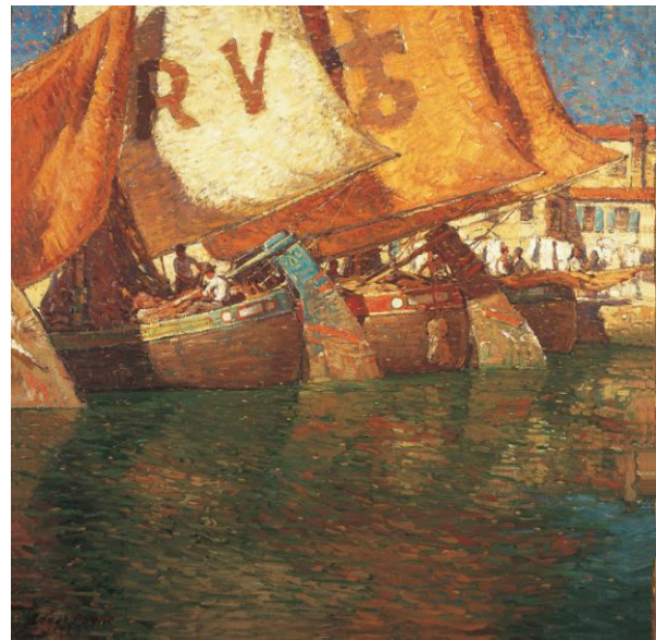
LEFT to RIGHT: Sunset, Canyon de Chelly , 1916. Oil on canvas, 28 x 34 in. Mark C. Pigott Collection; Cargo Boats, Chioggia, Italy , 1923. Oil on canvas, 43 x 43 in. The Buck Collection, Laguna Beach, California

PASADENA, CA – The Pasadena Museum of California Art (PMCA) is proud to present Edgar Payne: The Scenic Journey , a retrospective of artist Edgar Payne (1883–1947), one of the most gifted of California’s early plein-air painters. Payne’s work exemplifies the power and dynamism that separate California Impressionism from the picturesque French Impressionism of the 18 th Century. One of the first exhibitions of his work in over forty years, the retrospective features nearly 100 paintings and drawings, as well as photographs and objects from the artist’s studio; the exhibition will be on view from June 3 - October 14, 2012.