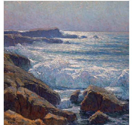
Untitled [Laguna Seascape], c. 1918 Oil on canvas, 43 1/16 x 43 1/8 in. Collection of D.L. Stuart Jr.